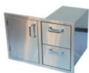
Combination Door and Drawers - CD2DRW