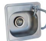
Stainless Steel Sink SINK