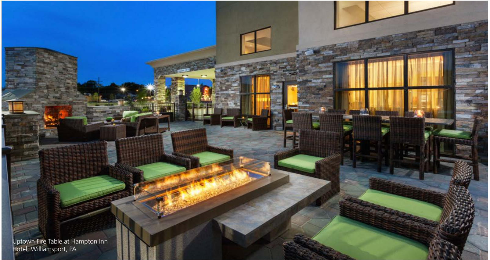
Uptown Fire Table at Hampton Inn Hotel, Williamsport, PA

Commercially-rated outdoor products by The Outdoor GreatRoom Company™ include gas burners, fire pits, fire tables, and outdoor kitchens. Both standard and custom products can be commercially-rated and include added safety features. All fire products use our UL listed Crystal Fire™ Burner. Perfect for multi-family residences, hotels, sports stadiums, restaurants, and more. We strive to deliver the best product for your commercial setting and professional customer service before, during, and after your commercial project. Visit outdoorrooms.com/Commercial to get more information regarding our commercial services.