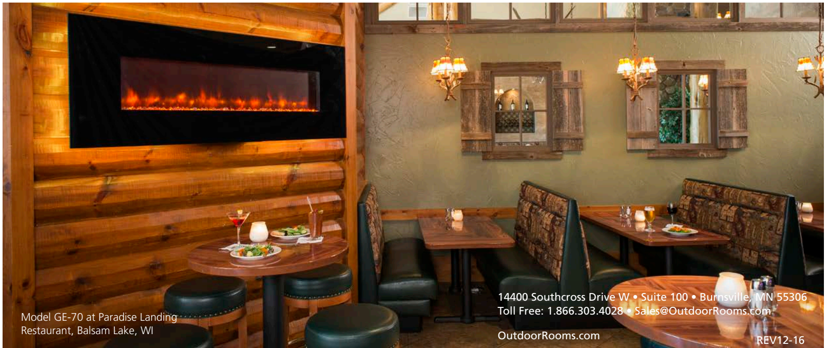
Model GE-70 at Paradise Landing Restaurant, Balsam Lake, WI

Commercially-rated Gallery Collection Indoor Fireplaces by The Outdoor GreatRoom Company™ are a great, cost-effective, alternative to wood burning or gas fireplaces. Put in any commercial space for instant ambiance. These units are CSA tested for safety and require minimal installation—saving time and money. Perfect for multi-family residences, restaurants, hotels, office spaces, and more. Visit outdoorrooms.com/Commercial to get more information regarding our commercial services.